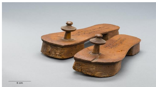
Figure 1. Tippu Tip. "Inscribed Clogs Gifted to Herbert Ward." c.1890. One More Voice .