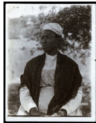
Figure 1. Jones, Neville. “Semane Khama.” Early twentieth century. One More Voice .

You will conduct your archival research in One More Voice , a freely accessible project of digital humanities scholarship that focuses on identifying, documenting, and critically engaging with the voices of racialized creators in British imperial and colonial archives.