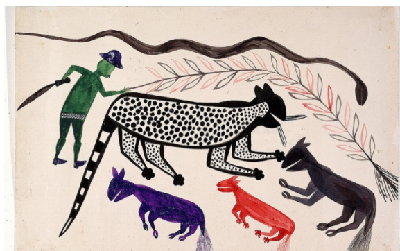
Figure 2. Djilatendo (Tshyela Ntendu). “Les Animaux.” c.1930. One More Voice .

One More Voice therefore stresses the need for “highly-considerate critical practices when working with these voices,” and I ask that you remain mindful of this in your own research and writing.